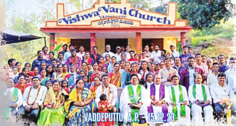
VADDEPUTTU, A.P. - 15.12.23

Blessed are those who hear the Gospel of Jesus Christ and work towards its exaltation! Great are their blessings on Earth and in Heaven!