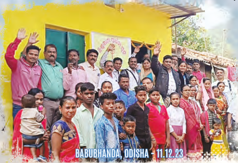
BABUBHANDA, ODISHA - 11.12.23

Return Requested: VISHWAVANI SAMARPAN 1-10-28/247, Anandapuram, ECIL Post, Hyderabad-500062.