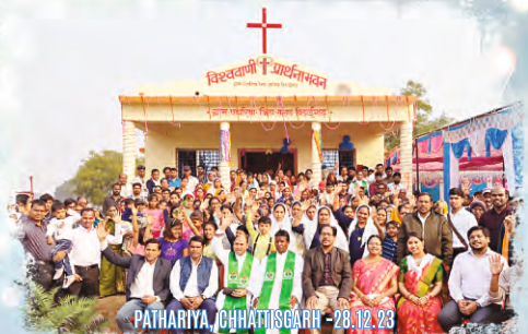
PATHARIYA, CHHATTISGARH - 28.12.23