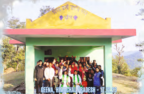
GEENA, HIMACHAL PRADESH - 17.12.23