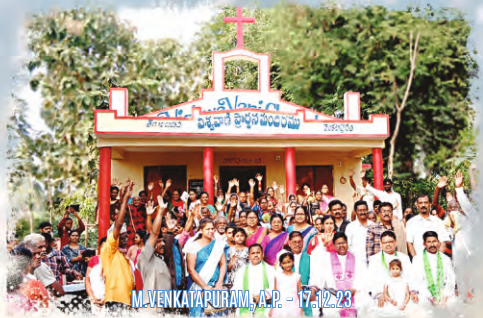
M.VENKATAPURAM, A.P. - 17.12.23