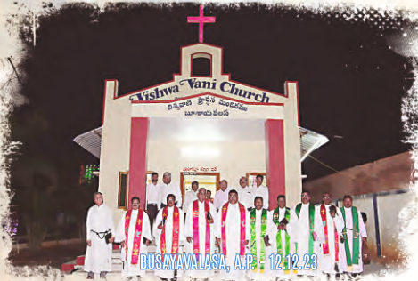
BUSAYAVALLASA, A.P. - 12.12.23