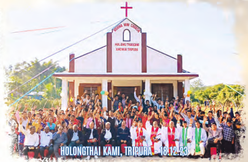
HOLONGTHAI KAMI, TRIPURA - 18.12.23

Blessed are those who hear the Gospel of Jesus Christ and work towards its exaltation! Great are their blessings on Earth and in Heaven!