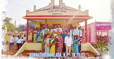
GUNNATHOTTALASA, A.P. - 19.12.23