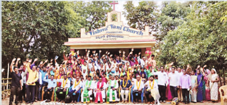
IPPAMANUGUDA, A.P. - 24.09.23