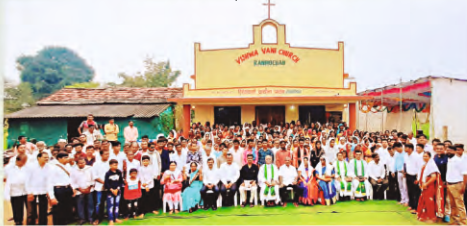
RANMOCHAN, MAHARASHTRA - 25.09.23

- Praise Jesus for He has given New church buildings in 9 mission fields!