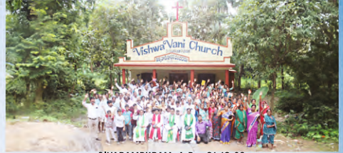
SIVARAMPURAM, A.P. - 01.10.23