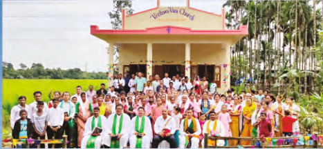
FERSUABARI, ASSAM - 24.09.23