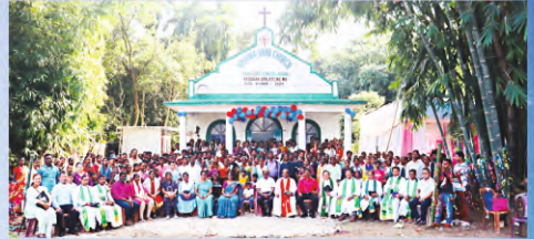
SINGIJHORA, WEST BENGAL - 01.10.23