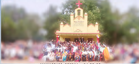
MAHASINGI, ODISHA - 24.09.23