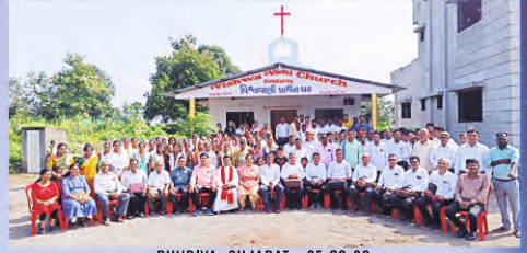
RUNDIYA, GUJARAT - 25.09.23