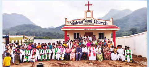
PANDRIVALASA, A.P. - 01.10.23