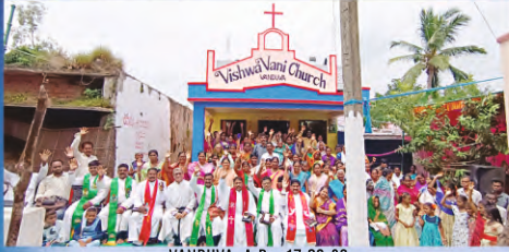
VANDUVA, A.P. - 17.09.23

Return Requested: VISHWAVANI SAMARPAN 1-10-28/247, Anandapuram, ECIL Post, Hyderabad-500062.